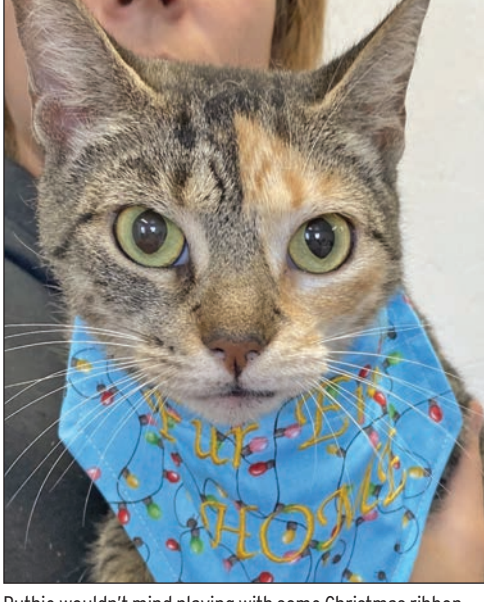
Ruthie wouldn't mind playing with some Christmas ribbon.