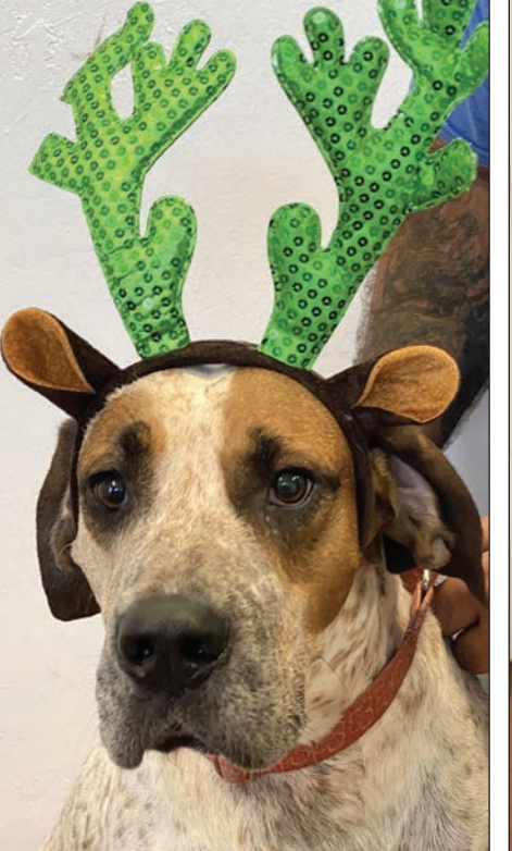
Maximus is ready for Christmas presents!