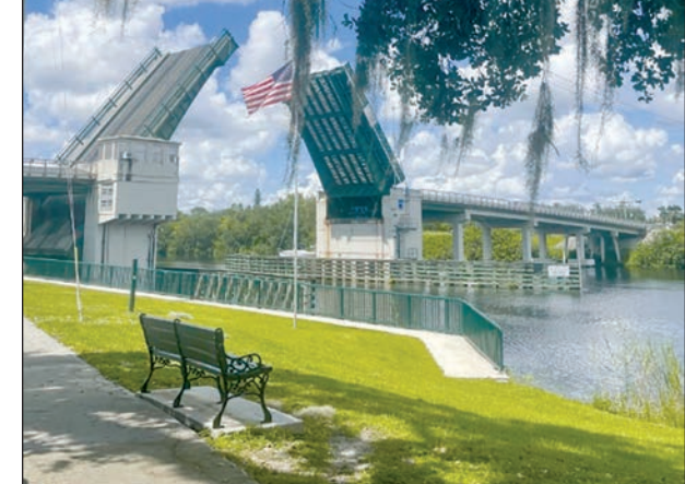
Benches have been added overlooking the river as part of recent improvements to Barron Park.

Canopied with oak trees, you can find your way back to old Florida in the City of LaBelle. Through several collaborative projects, La-Belle Downtown Revitalization Corporation (LDRC) and the City of LaBelle have breathed new life into downtown, the heart of their community. These include a complete streetscape project featuring the installation of lighting, benches, and murals, allowing LaBelle's downtown district to become a walkable space for residents and visitors. With funding from a Small Matching Grant from the Department of State, Division of Historical Resources, LDRC designed a self-guided walking tour of downtown focusing on the time between the 1880s and 1930s. The tour also features bronze statues of children at play, which line the shaded streets. LDRC also obtained a Community Challenge Grant from AARP to install pavilions and seating in the City's treasured Barron Park along the Caloosahatchee