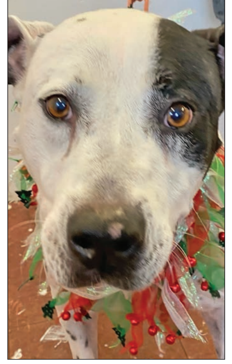
Kilo is sweet and shy. Can you give him a Merry Christmas? Gigi is feeling festive!