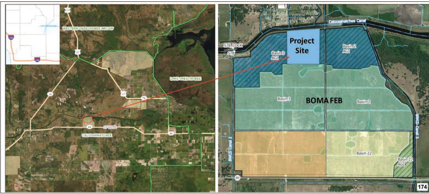
GLADES COUNTY – A $24.6 million water quality treatment and testing project was approved at the Nov. 18 meeting of the South Florida Water Management District Governing Board.