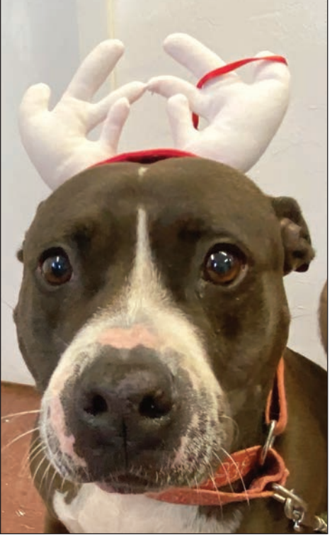
Missy can't wait for Santa to bring her very own family.