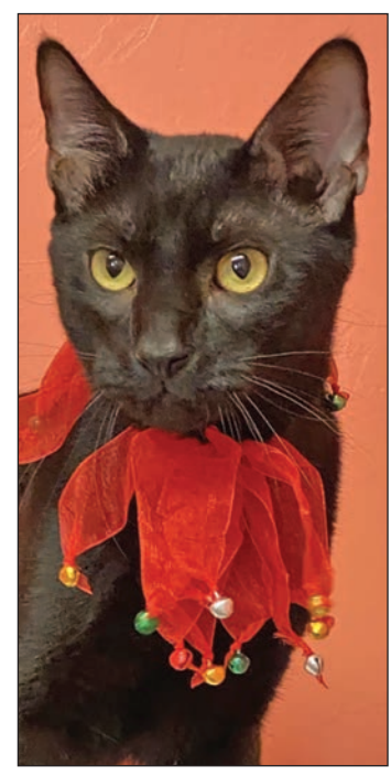
Robbie would like nothing more than to climb your Christmas tree.