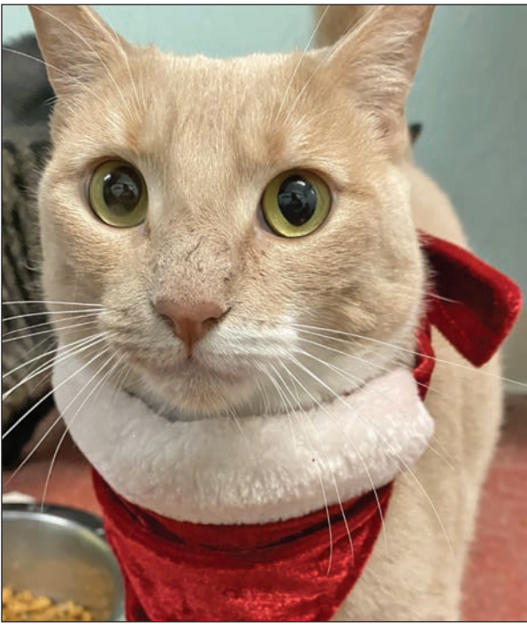
Lucky would be happy hiding amongst Christmas boxes and wrapping paper.

LABELLE — The Caloosa Humane Society has lots of dogs and cats just waiting to be your new best friends. The Caloosa Humane Society, Inc. is a not-for-profit, 501 (c) (3) status organization that receives no federal, state, or local funding and relies on donations, bequests and fundraising events. The shelter, 1200 Pratt Blvd in LaBelle is open Tuesday - Saturday from 11 a.m. to 4:30 p.m. For more information, call 863-675-0997. [Photos courtesy of Caloosa Humane Society]