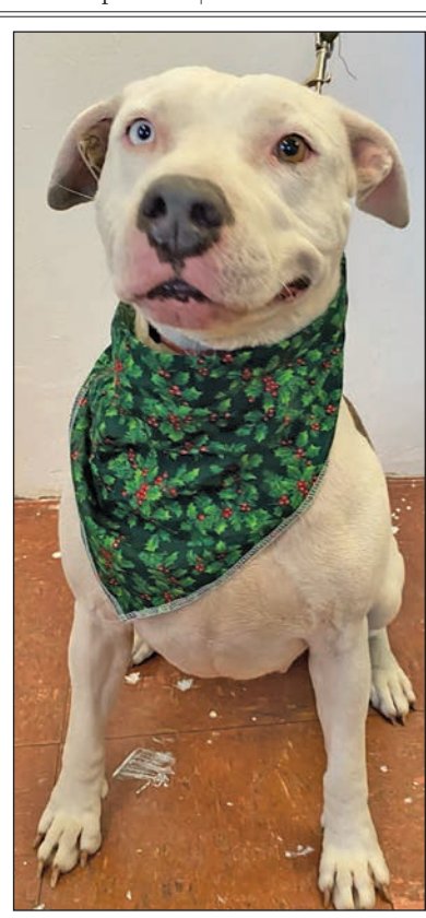
Hope will meet you under the mistletoe.