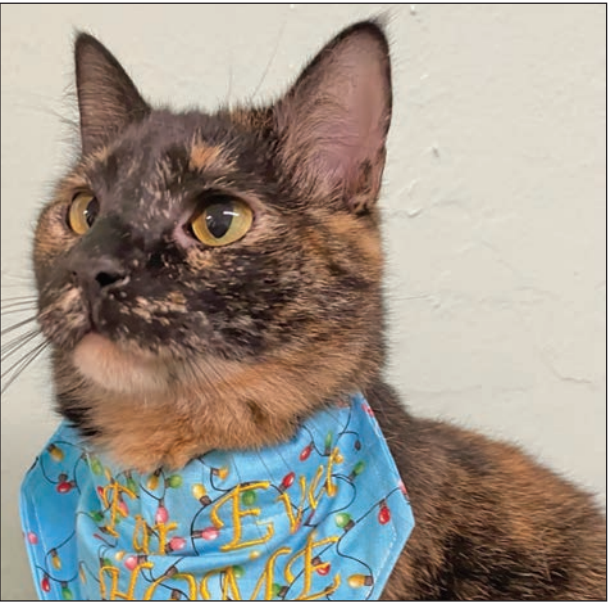
Flower would like nothing more than to be on your lap on Christmas morning.