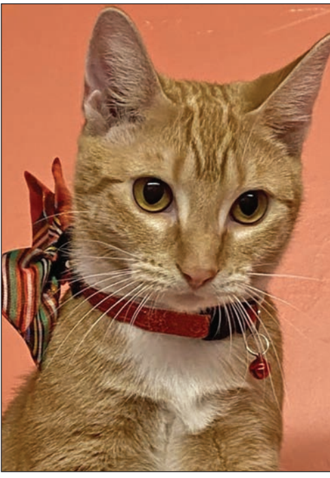
Brandy would like nothing more than to wake up under your tree on Christmas morning.