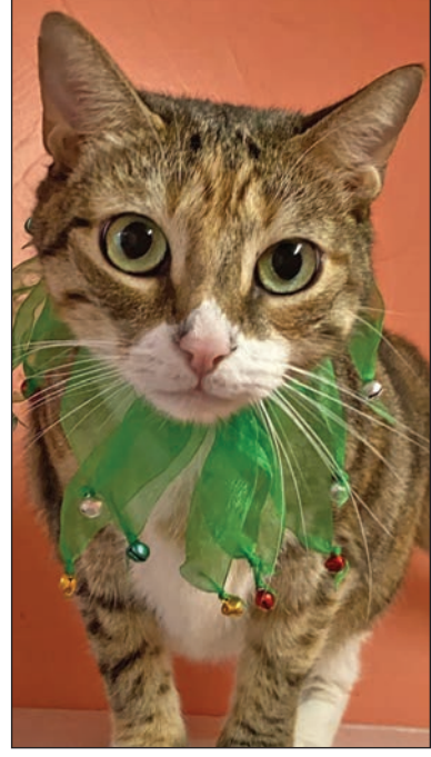
Little Bit would like nothing more than to snuggle with you on Christmas morning.