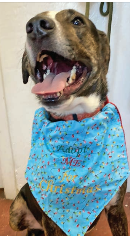
Charlie says "Adopt me for Christmas"!