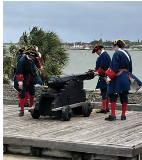
ST AUGUSTINE - Park personnel and volunteers dress in period costume to fire a cannon at Castillo de San Marcos