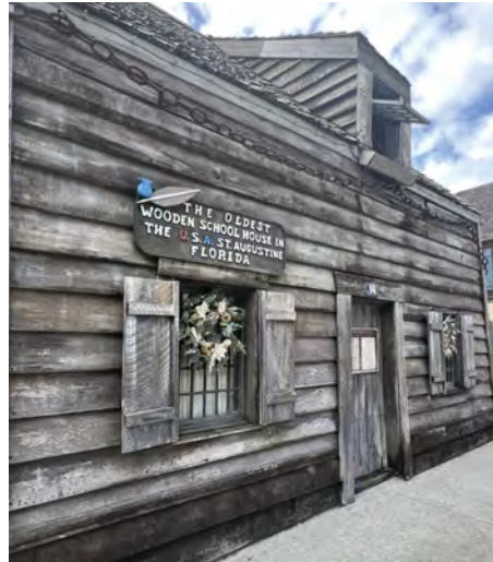
ST. AUGUSTINE - The Oldest Wooden Schoolhouse has been preserved to reflect the homestead life of settlers and school life in the 1800s.

The National Shrine of Our Lady of La Leche marks the spot of the first Catholic Mass in North America in 1565. The first Catholic parish in St. Augustine was founded in 1565, but early churches were destroyed by fires. The Cathedral Basilica of St. Augustine, which has stone walls, was built in 1797.