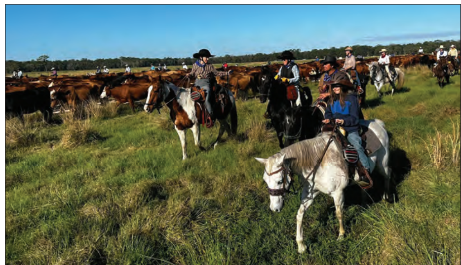
About 400 riders participated in 2022 Great Florida Cattle Drive, which was held in honor of the 500th anniversary of the arrival of cattle in Florida. The drive was originally planned for 2021, but had to be postponed due to the COVID-19 pandemic.

were in the “elder” category – over 60 years of age. The oldest was 91. The youngest rider was 5 years old.