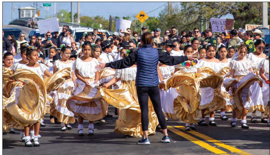
LABELLE — Children enjoyed participating in the parade.