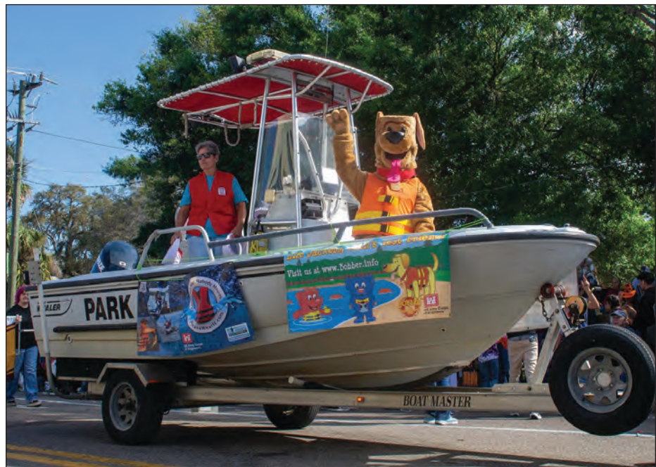
LABELLE — The Swamp Cabbage Festival Parade was held Feb. 22.