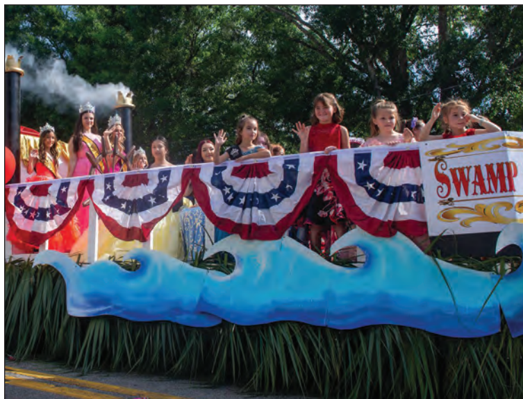
LABELLE – Festival royalty enjoyed the parade on Feb. 22. See Page 2 for more photos.