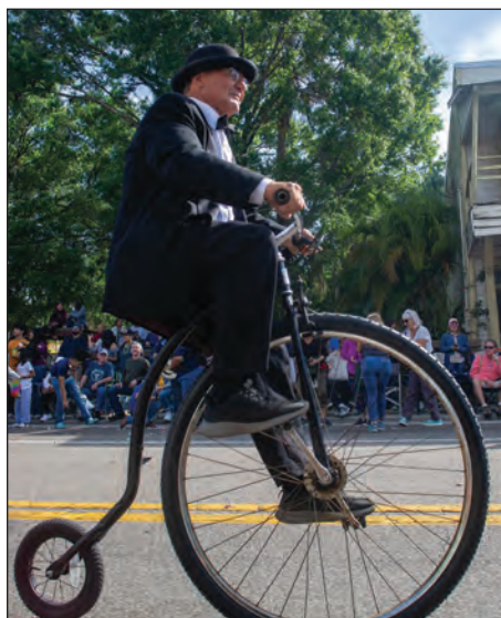
LABELLE — There was plenty to see at the Swamp Cabbage Festival Parade on Feb. 22.

The festival is held each year on the last full weekend in February.