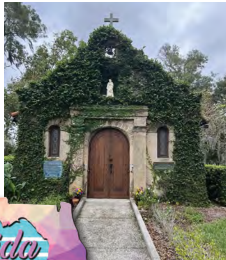
ST. AUGUSTINE - The National Shrine of Our Lady of La Leche marks the spot of the first Catholic Mass in North America in 1565.