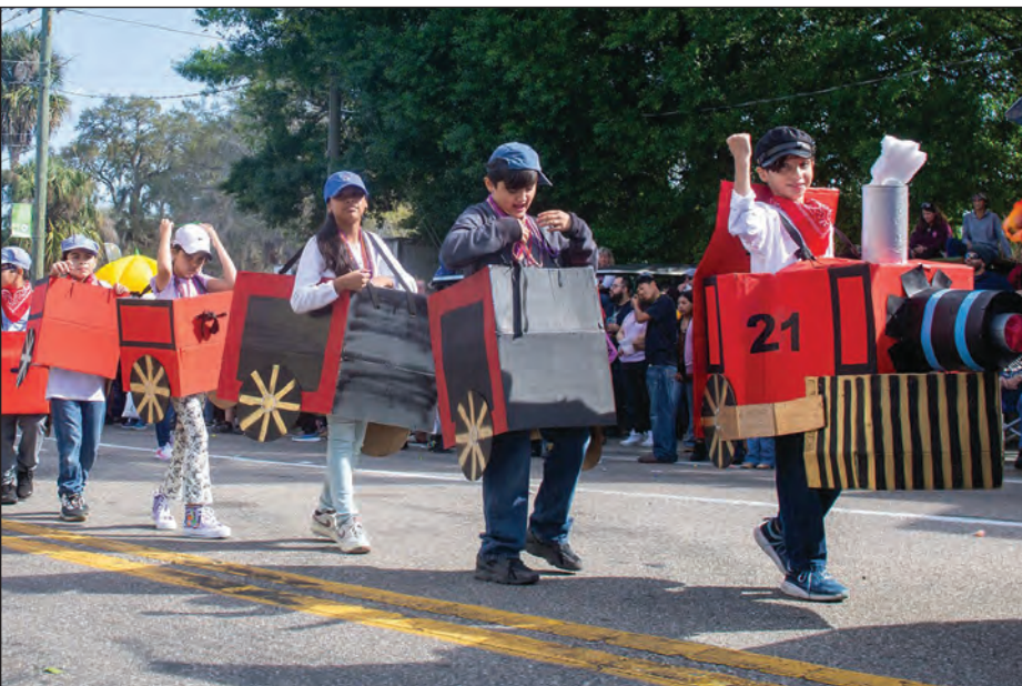
LABELLE — The theme of the 2025 Swamp Cabbage Festival was 'Planes, Trains and Automobiles: A travel through history.'

Festival Swamp Festival Parade winners were: • From page 1 • Best Business Entry: Extreme Temp Air Conditioning & Heating; • Civic/Non-Profit Organization: Hendry County Workforce Development; • Faith Based: Iglesia Christiana Restauracion; • Good Neighbors: Bayshore Cloggers and Tempco Pest Control; • Marching Band: LaBelle High School Marching Band; • Youth/Family: LaBelle High School FFA; • Best Overall: LaBelle High School Marching Band.