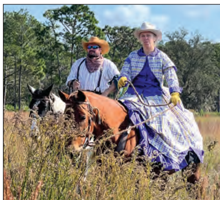
Participants are encouraged to dress in period attire.

Anyone can go, so long as you have a horse to ride or a horse- or mule- drawn wagon to ride in. Those