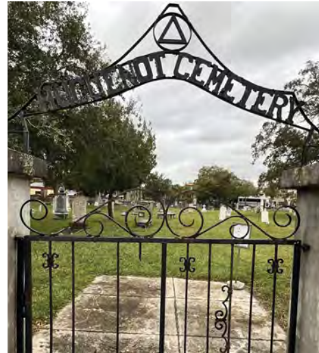
ST. AUGUSTINE - The Huguenot Cemetery (also known as the St. Augustine Public Burying Ground) in St. Augustine, Florida, located across from the historic City Gate was a Protestant burial ground between the years 1821 and 1884.